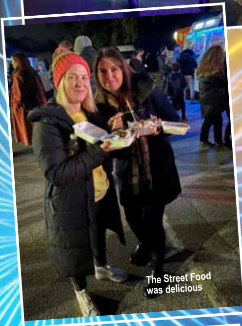
The Street Food was delicious