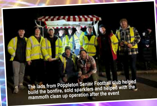
The lads from Poppleton Senior Football club helped build the bonfire, sold sparklers and helped with the mammoth clean up operation after the event