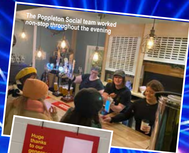
The Poppleton Social team worked non-stop throughout the evening

all of them, to everyone yone in the village who elped enable this tremen-