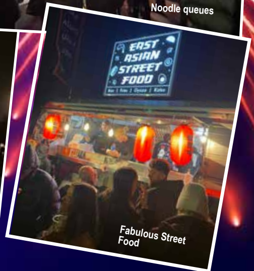
Fabulous Street Food