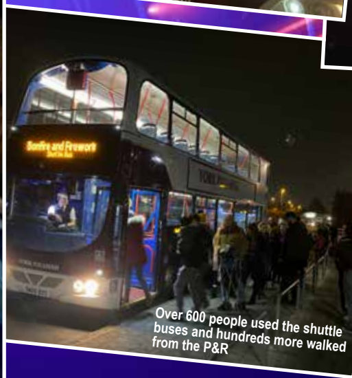
Over 600 people used the shuttle buses and hundreds more walked from the P&R