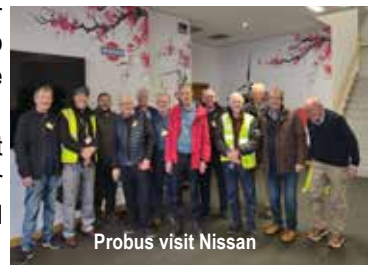
Probus visit Nissan