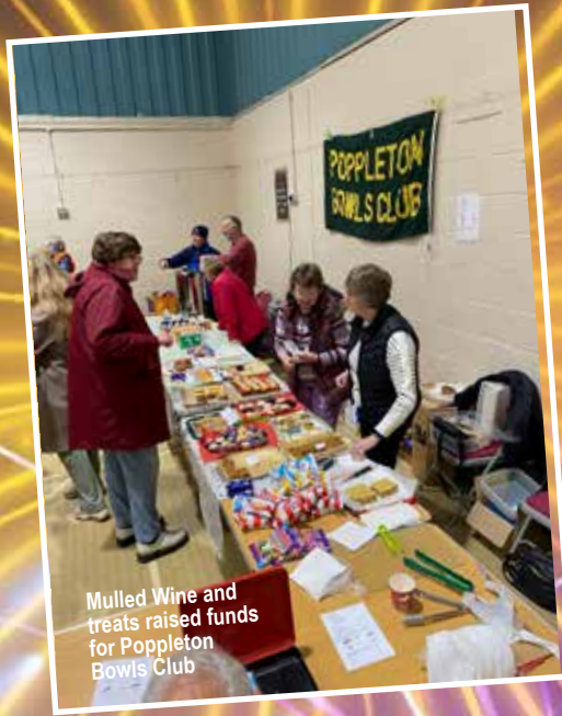
Mulled Wine and treats raised funds for Poppleton Bowls Club