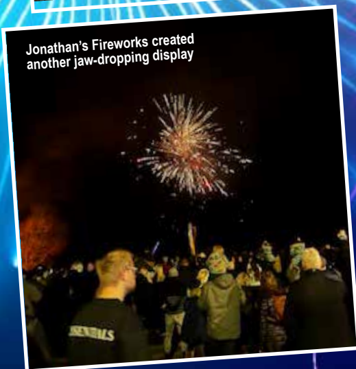
Jonathan's Fireworks created another jaw-dropping display