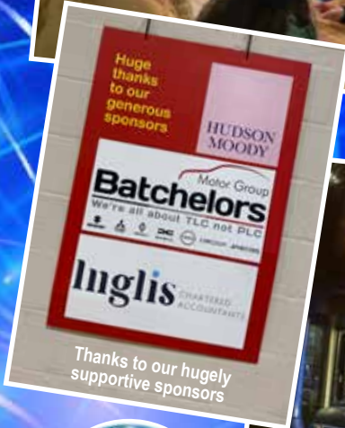
Thanks to our hugely supportive sponsors