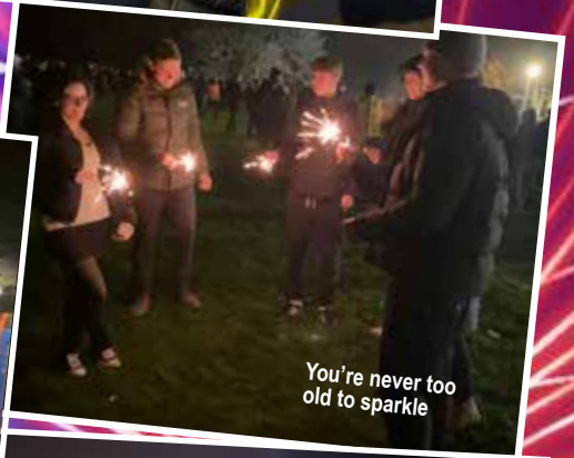
You're never too old to sparkle